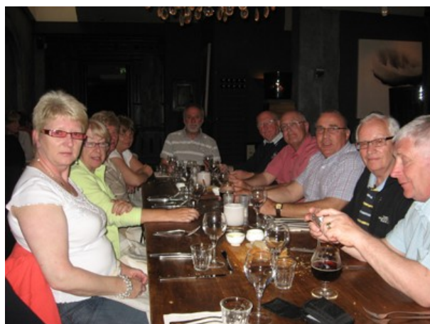
The gang enjoy a good meal in Amsterdam, in what looked from the outside like a small restaurant, but opened up inside like a Tardis