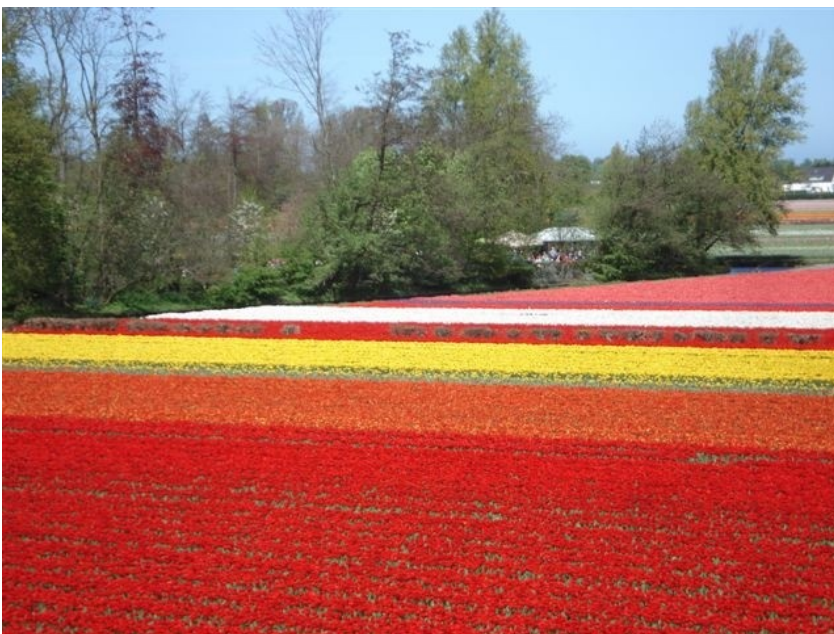
The bulb fields provided a brilliant splash of colour, and the timing of the trip was ideal for seeing them just about at their peak

Arriving at Duinrell Parc near Wassenaar next morning we were told that despite this part of Holland being famous for growing bulbs they can't apparently manage grass (except perhaps for the Brown Cafes of Amsterdam) and for this reason we were being relocated from our original island accommodation and dispersed around the complex